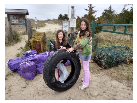
Our Youngest Volunteers on Clean-up Day in April