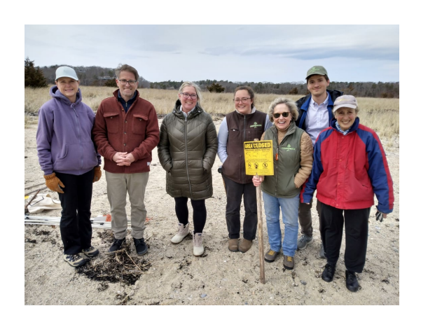
Friends / WLT "Fencing Party" in March

The Friends' annual Clean-up Day and Welcome Spring! Bird Walk (co-sponsored with the Wildlands Trust, Manomet, Inc., and the South Shore Bird Club) were well-attended events. Hardy volunteers from Wildlands Trust and the Friends also turned out in March to erect protective fencing for the nesting shorebirds, which returned weeks early again.