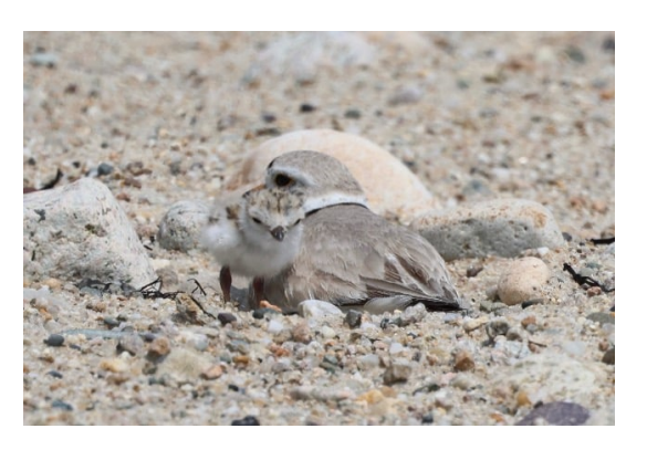
A Newborn Plover Chick Steps Out