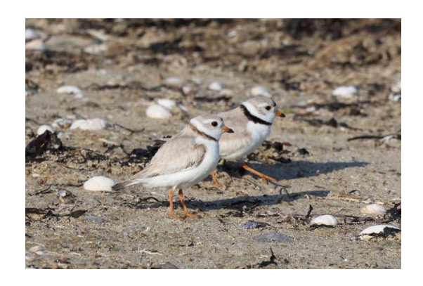
Pair of Piping Plovers Getting Ready to Nest