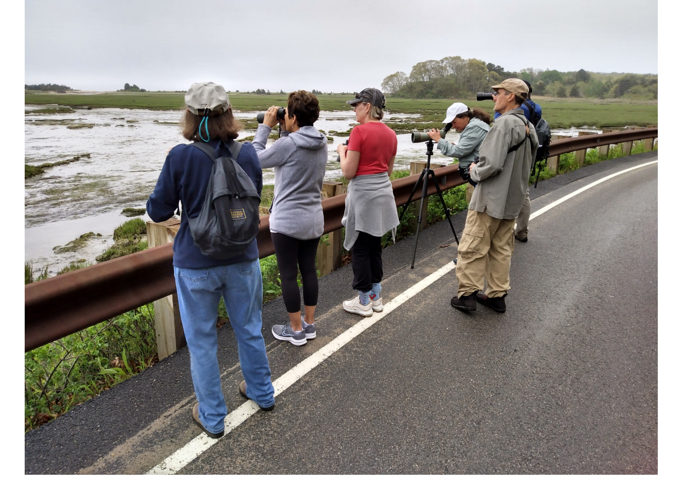
Spring Bird Walk Co-hosted by the Friends, Wildlands Trust, and Manomet.