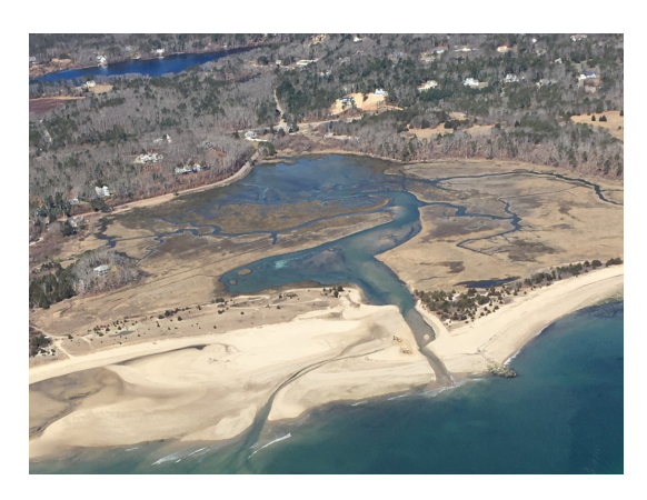
The restored inlet in late March