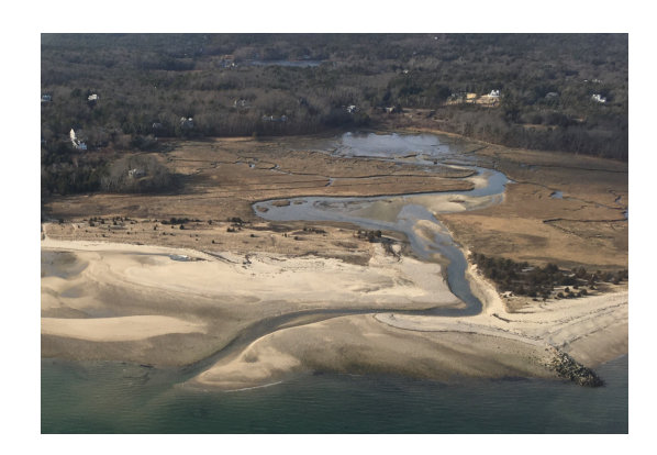
The diverted inlet prior to maintenance