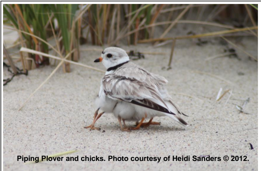
Piping Plover and chicks.